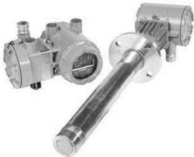
Figure 4-2. In-Situ Flue Gas Oxygen Analyzer