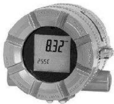
Figure 4-3. pH/ORP Transmitter